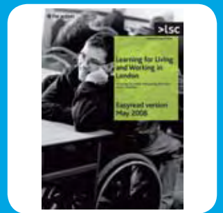
Learning for Living and Working in London