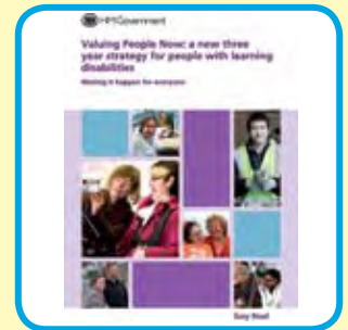
Valuing People Now

We have helped learning providers to work with charities and voluntary groups who have specialist knowledge and can give specialist support.