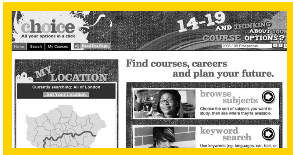
The Choice website is proving a hit with its target audience

London Region's Choice website just keeps getting better and better, combining more information than ever before and a suite of advanced guidance tools to help students select the right course.