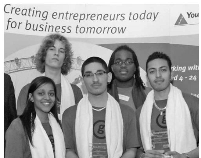
The winners of the Overall Young Entrepreneurs Award 2008 show off their innovative, environmentally friendly product

Ed Balls, Secretary of State for Children, Schools and Families, was impressed with what he saw. He spoke enthusiastically about how important it is for today's youth to develop enterprise skills, in order to improve the economic prosperity of the UK. He also spent time with each of the teams, finding out about their company and what they had learned from the Young Enterprise experience.