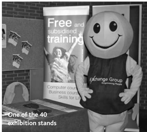
One of the 40 exhibition stands

The fair offered something for everyone. More than 40 employers manned exhibition stands, to advertise over 700 job vacancies. Training brokers and providers were also on hand to give advice and guidance, conduct CV surgeries and promote opportunities for further learning. And a stimulating programme of performances from Kensington & Chelsea College and Dress for Success added colour and drama to the occasion.