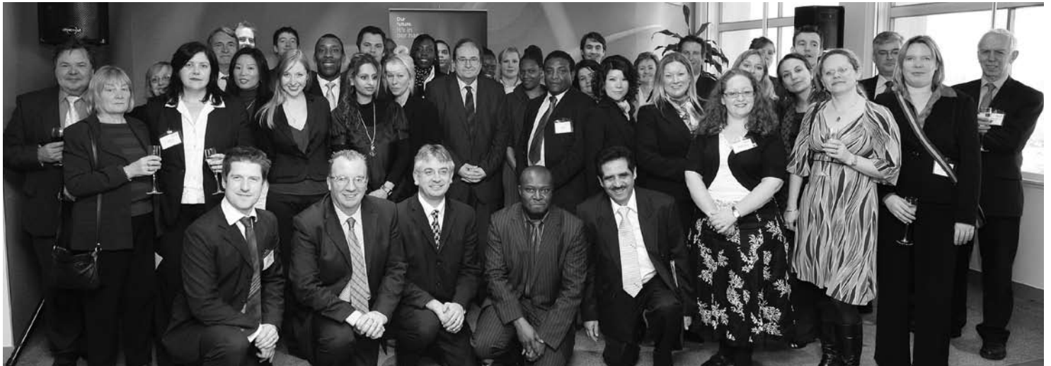
London's Train to Gain skills brokers lead the way by achieving a professional business advice qualification

In April, 46 of London's Train to Gain skills brokers achieved the Skills Broker Standard, which is a professional business advice qualification.