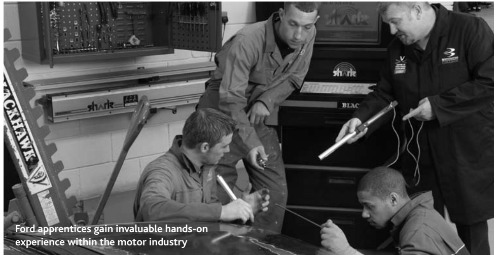
Ford apprentices gain invaluable hands-on experience within the motor industry

Skillnet Automotive Academy, the UK's leading training provider to the automotive industry, has been selected by Ford Motor Company to manage its national Apprenticeships programme, which is funded by the LSC.