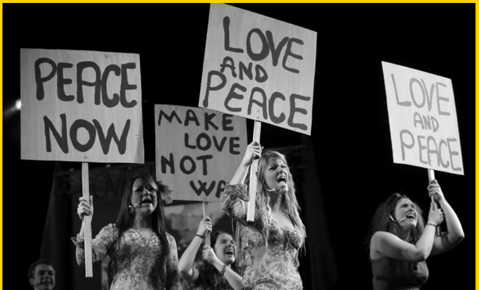
Students delivered stunning performances on both sides of the pond

Havering College is funded by LSC London East.