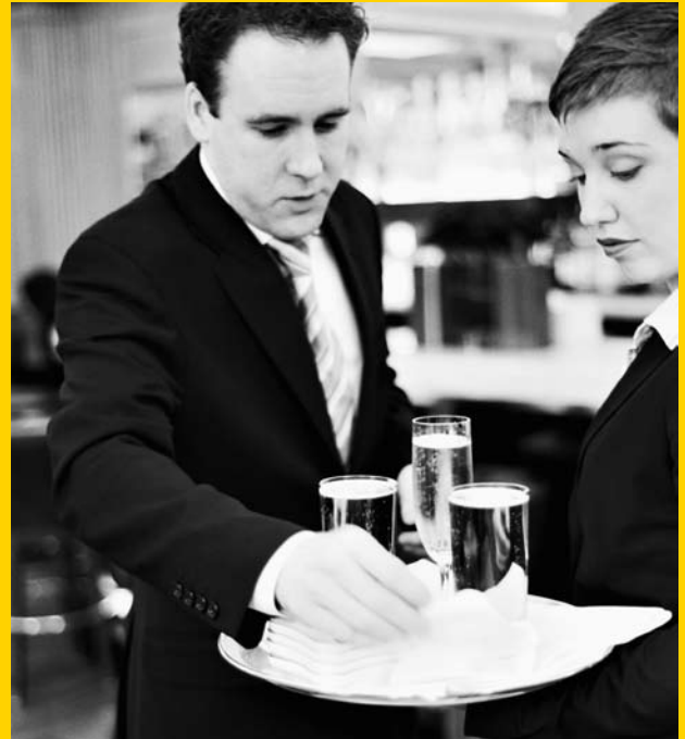
Hospitality is one of the employment sectors that will be participating in the EDP programme

"The pilots seek to start to address the change required in the mainstream offer