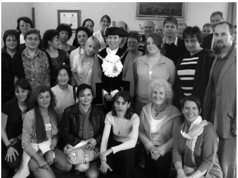
In full regalia: the Mayor of Bromley meets Grundtvig Project participants