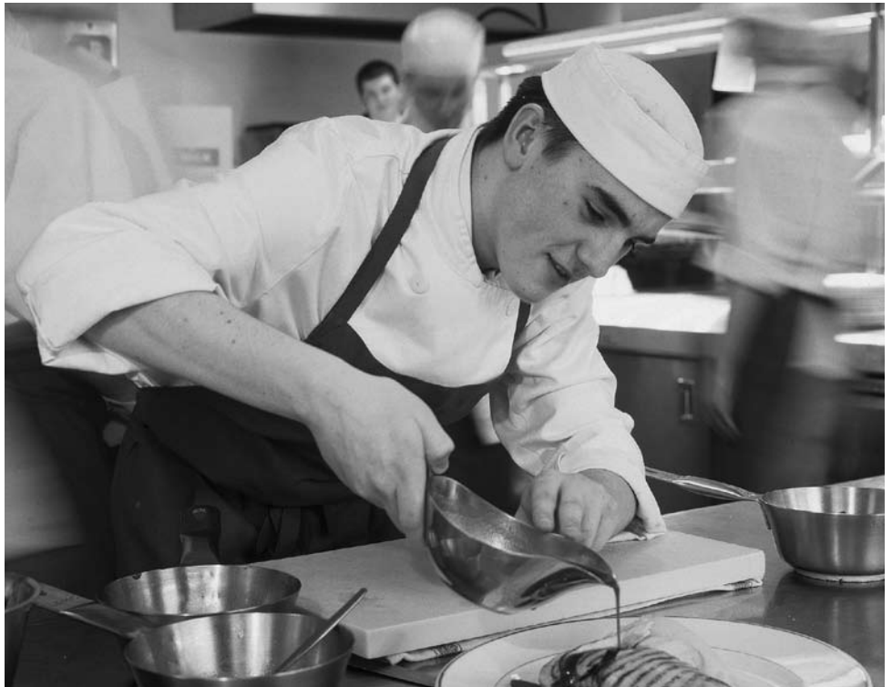
Professional cookery is among the many activities on the menu for the pilot Young Apprenticeship programme

350 pupils from London's inner city boroughs are currently involved in the programme