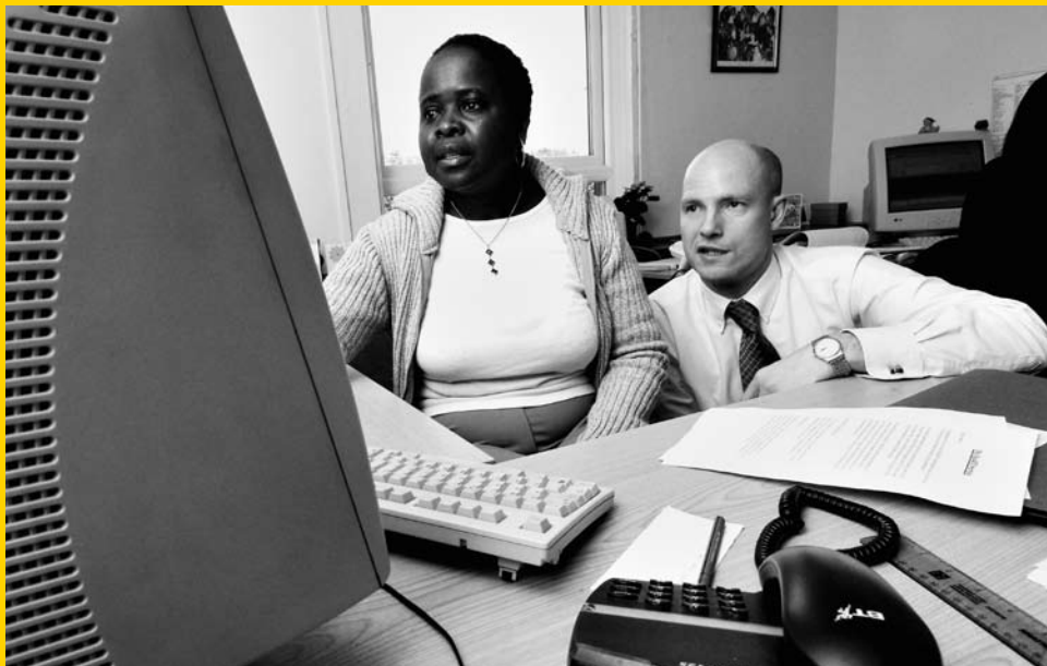
The colleges involved in London's EDP have targeted specific client groups, including adults with long-term barriers to employment

"The adult skills journey can be a complex one, involving a range of organisations working towards a common goal, but not always agreed priority groups. As public servants, we share a responsibility to use the funds allocated to us through Parliament as shrewdly as possible."