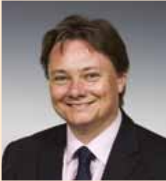
Iain Wright Parliamentary Under-Secretary of State for 14-19 Reform and Apprenticeships

The past year has seen record numbers of young people participating in post-16 education and training. Through the September Guarantee we are ensuring the offer of a suitable place in education and training to every 16- and 17-year-old who wants one, and we are building on this with the January Guarantee to offer all 16- and 17-year olds who are not in education, employment or training in January 2010 an appropriate offer of a place in training. Increased investment is leading to increased attainment with more learners than ever before gaining the skills and qualifications they need to prepare them for life and work. This success is testament to the hard work of schools, colleges and work-based learning providers, working in partnership with the Learning and Skills Council and local authorities.