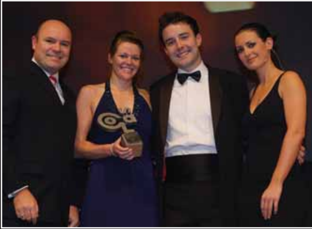
Winner of the Working in the Community award - Giantminds.

Not-for-profit Newcastle organisation Giantminds was successful in the Working in the Community category, sponsored by FE+, receiving recognition for its deliverance of an accessible enterprise education programme for young people aged between 11 and 18.