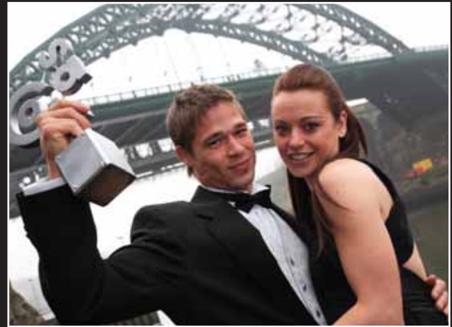
The tour of the region saw Brad and Angelina move onto Wearmouth Bridge.