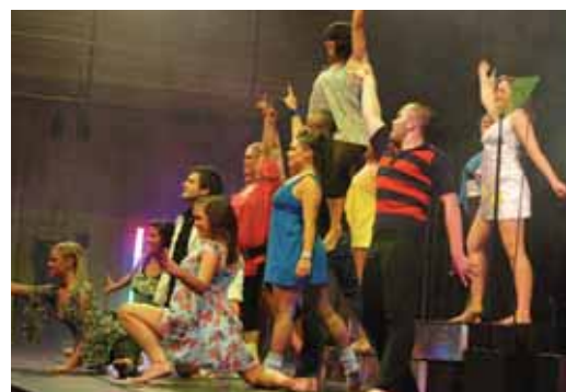
Stockton Riverside College