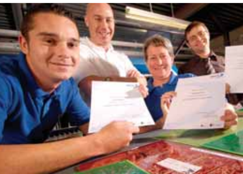
Faraday Printed Circuits