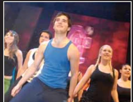
'Saturday Night Fever', one of three performances throughout the evening, by students from Stockton Riverside College , a Centre of Vocational Excellence in Performing Arts.