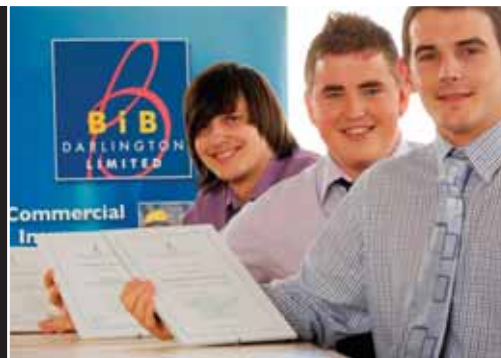
BiB Insurance Ltd