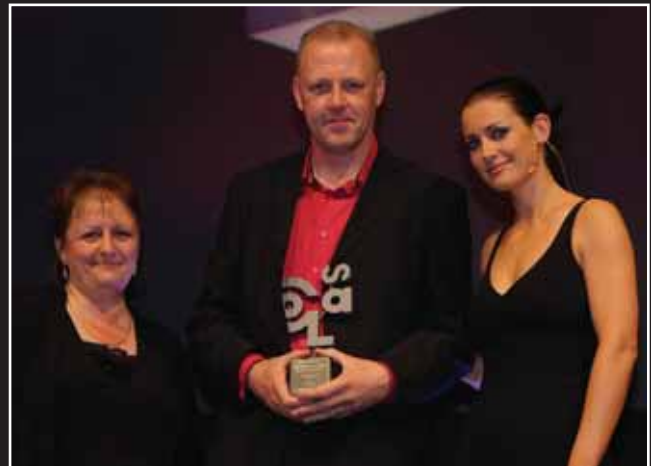
Winner of the Investment in Skills award - Cleveland Potash Ltd.