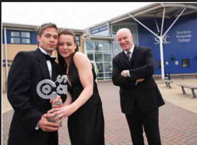
Finally, the tour came to an end at Stockton Riverside College.