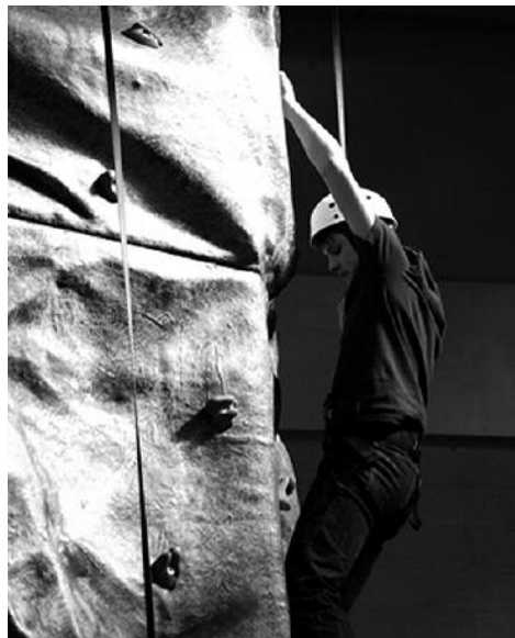
Interactive activities at Skills NorthWest

For more information visit www.skillsnw.co.uk