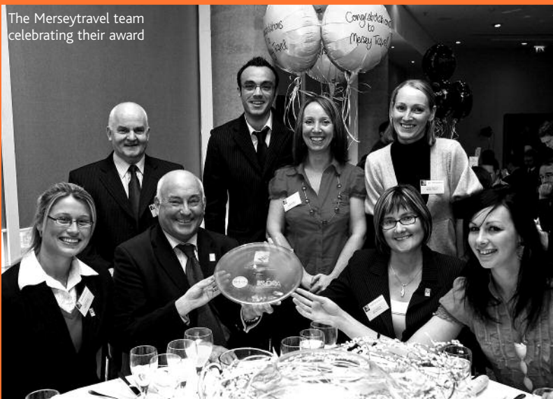
The Merseytravel team celebrating their award

"These awards are for those local authorities that have recognised the important part that Skills for Life plays within their workforce development strategies. We hope it will also encourage other employers to follow their example and embed Skills for Life into their organisations in a sustainable way."