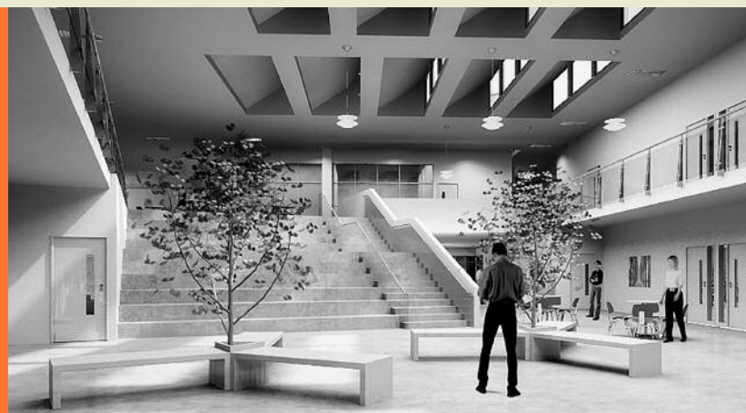
A computer generated image of South Sefton College