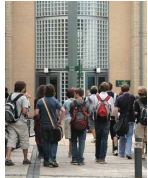
Richard Huish College, Somerset